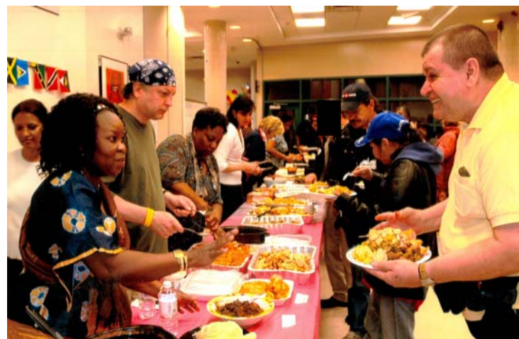
Smiling Faces and great food at the Cultural Splash